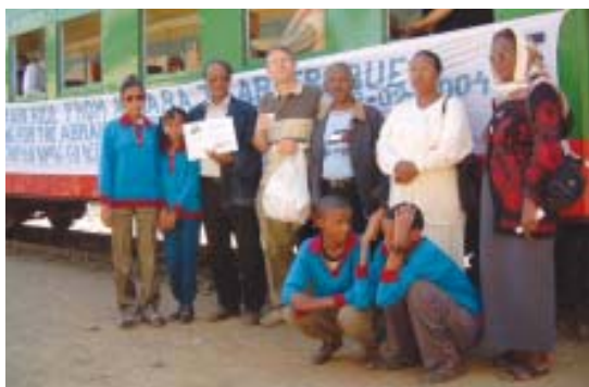
"Peace Train" fundraising in Eritrea