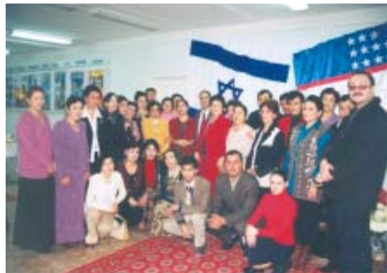
Bukhara Shalom Club members

A special meeting of the Shalom Club Uzbekistan took place in Bukhara with the participation of MASHAV training courses graduates from the districts of Bukhara and Navoi. Also present were representatives from the local NGOs, personnel from the Center for Small and Medium Enterprises, and staff from the Israeli Embassy in Tashkent. Later on the participants enjoyed a festive dinner followed by the performance of a local traditional Bukharian musical group.