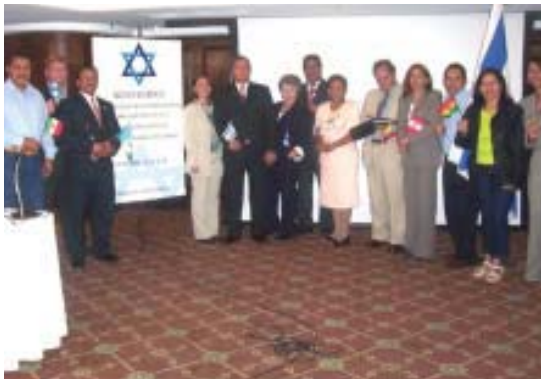
Shalom Clubs Presidents during their meeting in Venezuela

The Annual Conference of Latin America and the Caribbean Shalom Club Presidents was held in Venezuela in October with the participation of over 40 representatives from 9 countries: Colombia, Dominican Republic, El Salvador, Guatemala, Mexico, Nicaragua, Panama and Venezuela. The main theme of the Conference, held under the auspices of the Israeli Embassy in Caracas, was the value of volunteerism. Discussion included procedural and theoretical topics of interest.